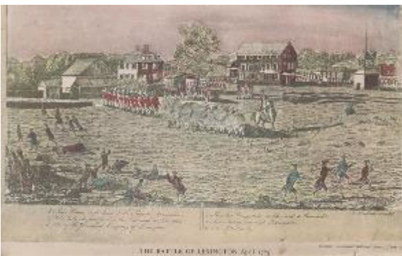
Amos Doolittle Engraving- from 1775 of the Battle of Lexington.