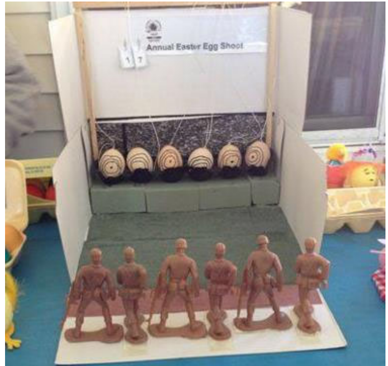
Easter means it is egg shooting season. See page 7 for more information.